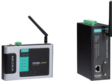
OnCell 5004-HSPA Series